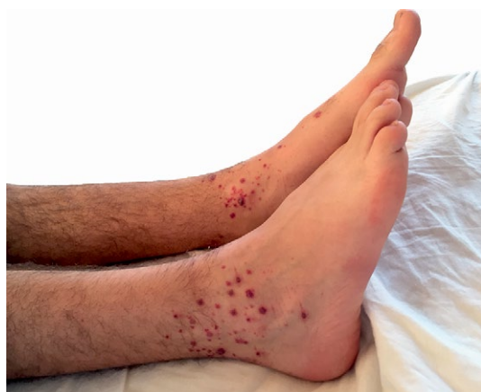
Fig. 2. Palpable purpura on both ankles.

disease with gastrointestinal and joint manifestations prior to the occurrence of skin purpura, complicated by CDI during corticosteroid therapy. To the best of our knowledge, this is the second published case of IgA vasculitis complicated by CDI in adults. Upon a thorough search, we found only five cases reported so far: four children [9-11] and one adult [12]. The authors suggested that antibiotic therapy, intestinal lesions (mucosal ischemia) caused by IgA vasculitis and corticosteroid therapy could have led to a change in intestinal microbiota and, consequently, to overgrowth of C. difficile , increasing the risk of CDI. The use of antibiotic therapy remains the most important risk factor for the development of CDI [13]. Our patient received antibiotics (amoxicillin) for a pharyngitis, prescribed by his primary care physician; in addition, it was the patient's 3rd week of corticosteroid therapy, which may have played a key role in the developing of CDI.