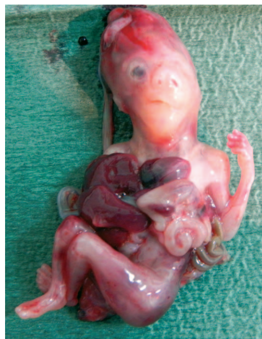
Figure 3. Macroscopic image of the fetus. Large abdominal wall defect with evisceration of the liver, spleen, and a major part of the gastrointestinal tract. Anophthalmia is visible.