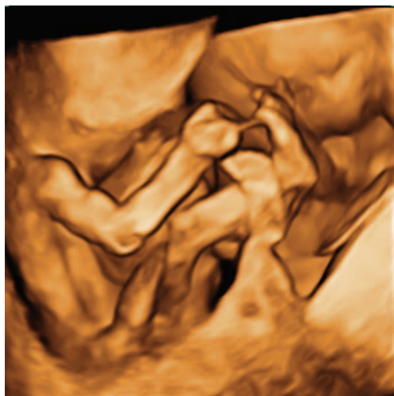
Figure 2. Pregnancy 14 weeks of amenorrhea. Three-dimensional ultrasound-A large defect of the anterior abdominal wall is visible.

The pathogenesis is not fully elucidated. One widely accepted theory, suggested by Cantrell, is a developmental failure of a segment of the lateral mesoderm around gestational age 14 to 18 days. As a consequence, the transverse septum of the diaphragm does not develop, and the paired mesodermal folds of the upper abdomen do not migrate ventromedially. [1] The variety of the associated anomalies sustain the hypothesis that multiple factors