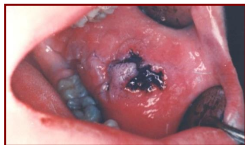
Fig. 3. Ulcerative lesion of 2 cm - stained dark blue (positive reaction)

2. S. N., Iasi county, pensioner, smoker for over 50 years and alcohol user presented with an ulcerative lesion of less than 1 cm in diameter, round, with slightly pronounced edges, without hardened base, unpainful, situated in the medial 1/3 segment of the lower lip, with the surrounding mucosa of normal appearance (fig. 3). The lesion had been present for almost 3 years. We proceeded using toluidine blue to dye the ulceration, washed the excess with