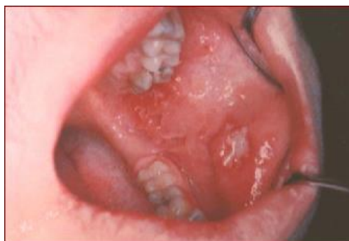
Fig. 1. The ulcerative lesion

1. I. I., Iasi town, came in for consultation for an ulcerative lesion, painful manifestation on the left cheek, and swelling of the surrounding mucosa, present for a few days (fig. 1). After cleaning the dye (fig. 2) we noticed a second ulcerative lesion of 2 cm in diameter which stained dark blue