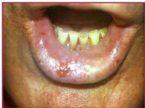
Fig. 5. Oval superficial ulceration

3. C. V., from Vaslui County, retired, smoker, was examined for an oval superficial ulceration of less than 1 cm in size, located on the red part of the lower lip, the surrounding mucosa having a whitish leukoplastic appearance. The lesion was noticed a few months earlier, increased in size gradually, and was slightly bleeding (fig. 5). Physical examination was completed with the toluidine blue vital staining which, after the removal of the extra amount of substance with acetic acid, remained fixed in the ulceration area. The toluidine blue vital staining was considered positive (fig. 6).