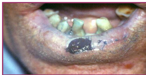
Fig. 4. Dark blue stain (positive reaction)

acetic acid, and it resulted a dark blue stain (positive reaction) (fig. 4). Exfoliating cytology made the diagnosis of inflammatory smear with hematins, superficial and intermediary epithelial cells of normal appearance. Treatment: removal of the ulceration using a type "V" resection on the lower lip and suture of the margins.