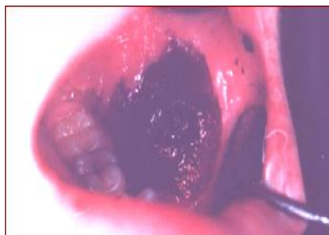
Fig. 2. Toluidine blue aqueous solution

(positive reaction) (fig. 3). A 7 days treatment including rinses with 5% tetracycline solution led to the healing of the ulceration. The diagnosis was ulcerative stomatitis. Although the dye was retained in the central area leading to a misinterpretation of malignant lesion, in fact it was an inflammation of the oral mucosa. In this case, the toluidine blue response was false positive.