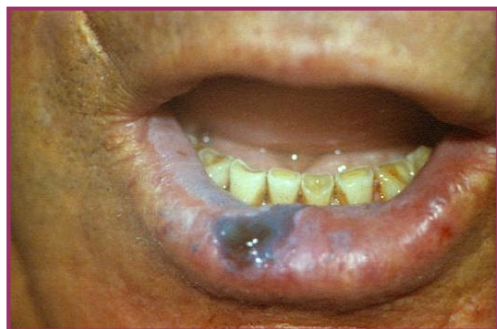
Fig. 6. Blue stain (positive reaction)

Treatment: excision of the ulceration from the lower lip until healthy tissue was reached. The histopathological examination